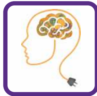
CREATIVITY & IMAGINATION